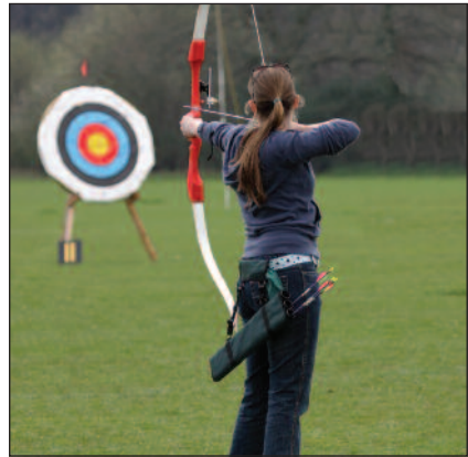
The Retreat, Field of Dreams